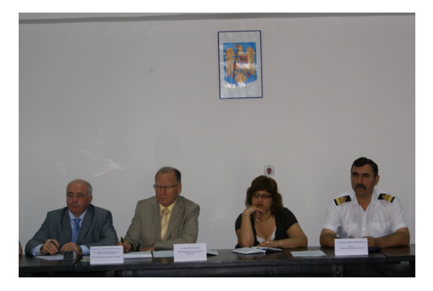
Meeting at the Maritime Hydrographic Directorate

Following its assessment, the team will make suggestions to improve Hydrography in Romania, e.g. through appropriate training courses and/or by forming a National Hydrographic Committee.