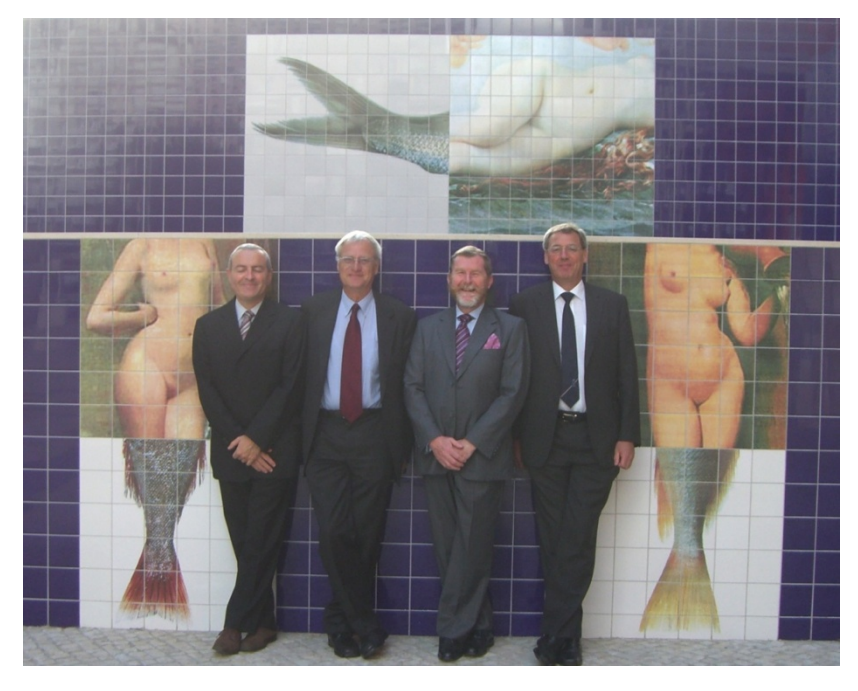
WEND TG - assisted by Maritime representatives, outside the EMSA HQ in Lisbon.