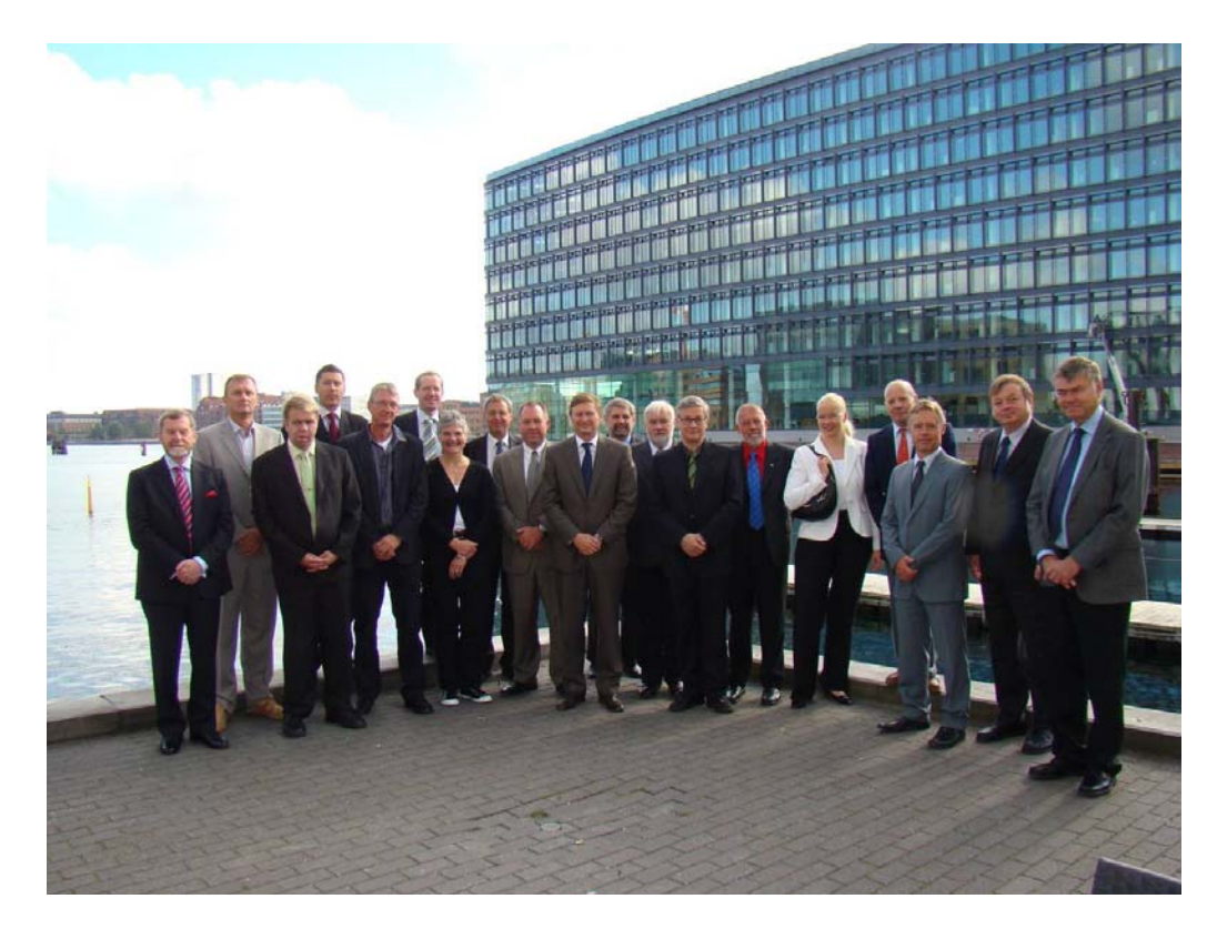
The participants of the meeting.

For further reading: IHB-website - Minutes of the 14<sup>th</sup> BSHC Conference.