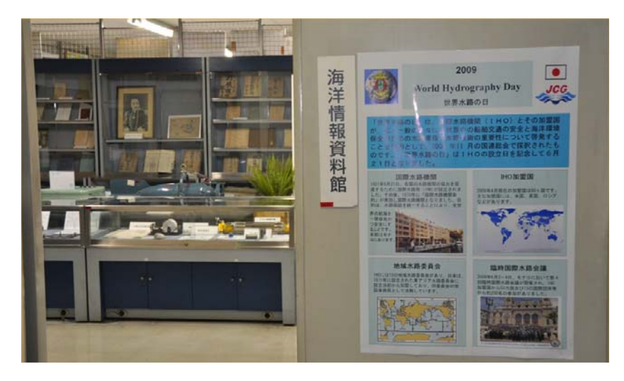
Hydrographic and Oceanographic Museum

2) The Hydrographic and Oceanographic Museum was opened to the public from 17 to 22 June, where IHO publications, a poster and slideshow describing the IHO, "Ino-Zu (Japanese historical maps)", and old Military Charts, were on display.