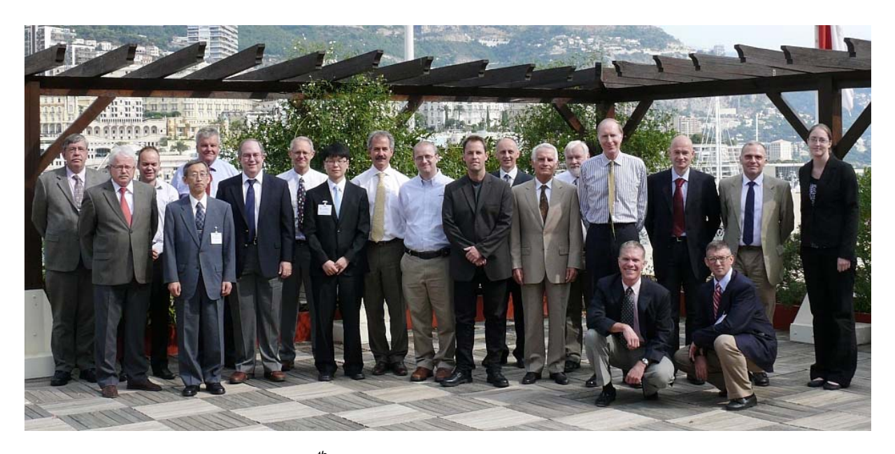
11th SNPWG Meeting (IHB, Monaco)

The 11<sup>th</sup> meeting of the Standardization of Nautical Publications Working Group (SNPWG) was held at the IHB, Monaco, from 7 to 11 September 2009. The meeting was attended by representatives from Denmark, Estonia, France, Germany, Korea, Japan, Norway, the UK and the USA. Industry participants from CARIS, Jeppersen and NOVACO also attended the meeting.