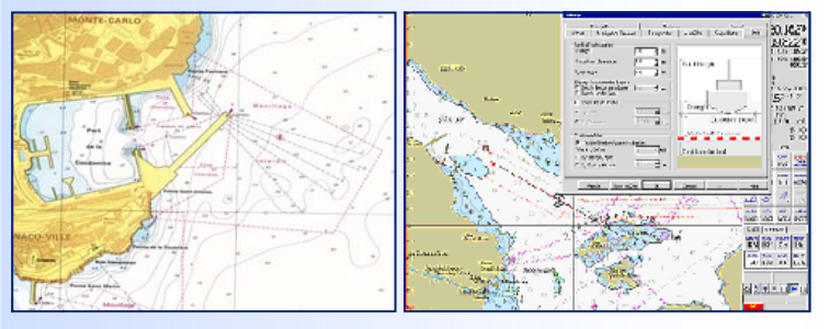
Example of a modern nautical chart

Highly significant milestones were achieved in the standardization of paper nautical charts by the adoption of the "Chart Specifications of the IHO" in 1982 and with the approval by the IMO in 1997 of the Performance Standards for Electronic Chart Display and Information Systems (ECDIS).