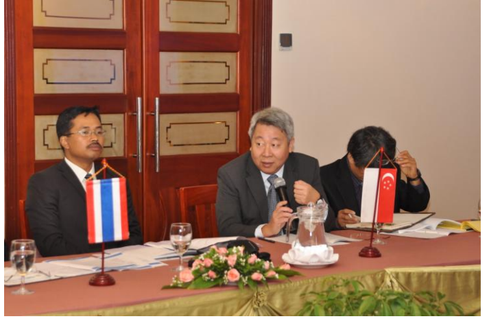
Figure 6 Opinion shared by Chief Hydrographer of Singapore