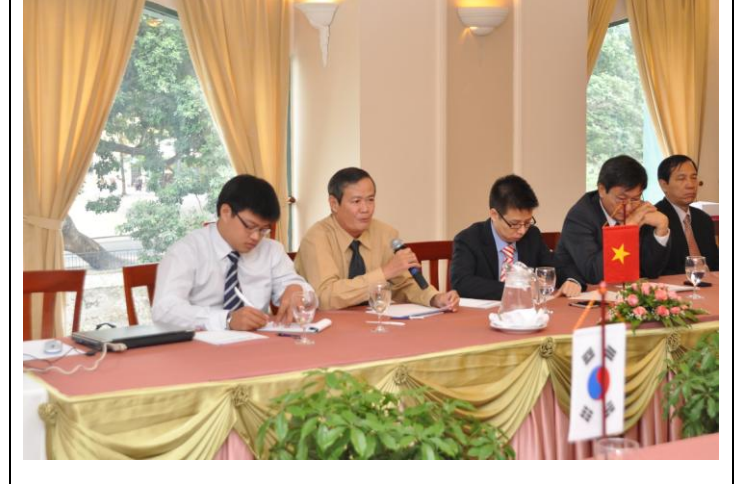
Figure 5 Opinion shared by VMS-S Deputy Director General