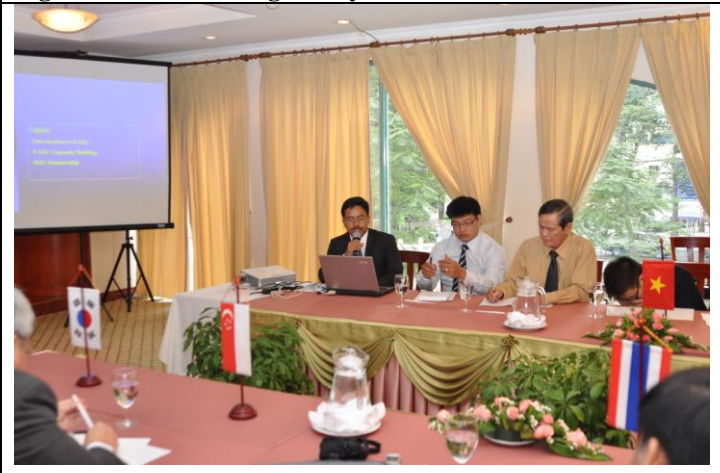
Figure 3 Presentation given by EAHC representative