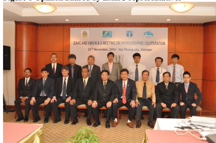
Figure 9 Commemorative plaque and souvenior presented Figure 10 Group photo of the participants by the EAHC Chairman to the VMS-N Director General

Day 2: Ha Long Bay visit supported by VMS-N and VMS-S.