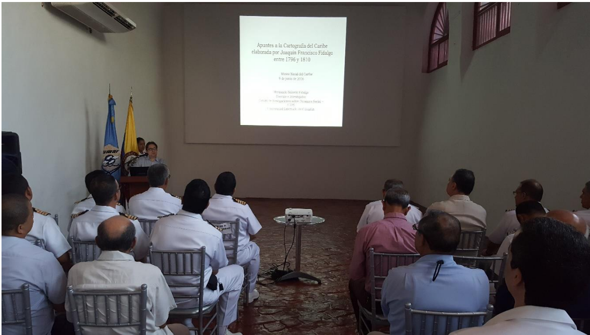
Photo 4. Conferences in Naval Museum for maritime guild

During the talks was presented exhibition Fidalgo which is a sample mapping Grenadian Caribbean, and also a historical tour of the life of the galleon San Jose.