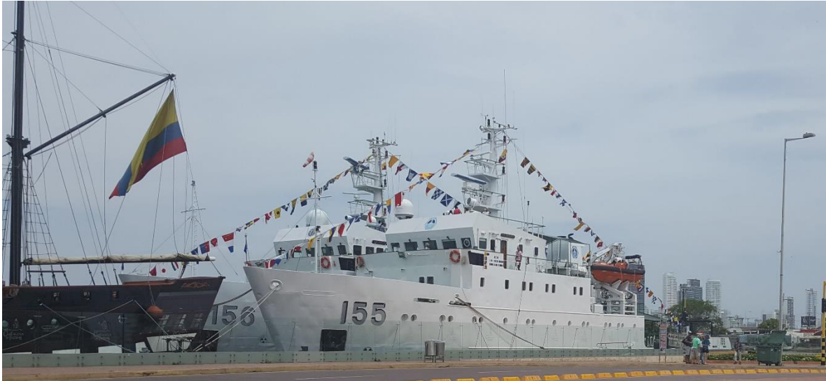
Photo 1. Image of hydrographic and Oceanographic ARC Providencia y ARC Malpelo ships.

On the occasion of the celebration of the 35th anniversary of the Oceanographic and Hydrographic ARC Providence and ARC Malpelo Navy Colombia ships, the Hydrographic Service presented to the national community the contributions of scientific research that these two platforms have made in favour of maritime development of the country.