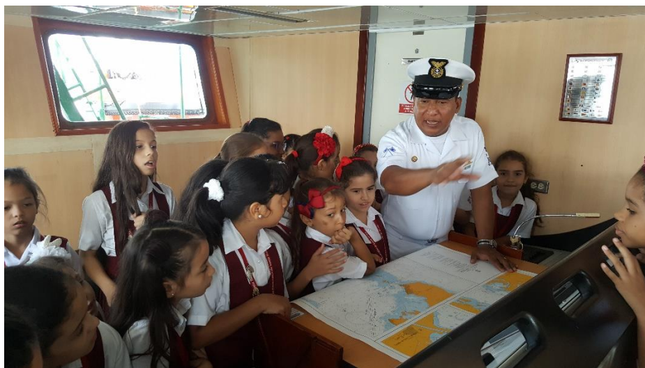
Photo 2. School children receiving lectures board navigation

This time besides the illustrious visitors are invited to children and young people to get to know the importance of hydrographic work on board ships of the Navy.