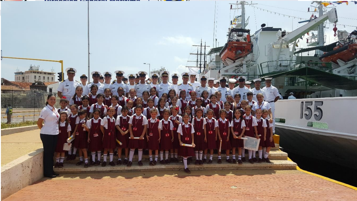
Photo 3. Official photo of visiting school children to hydrographic ships