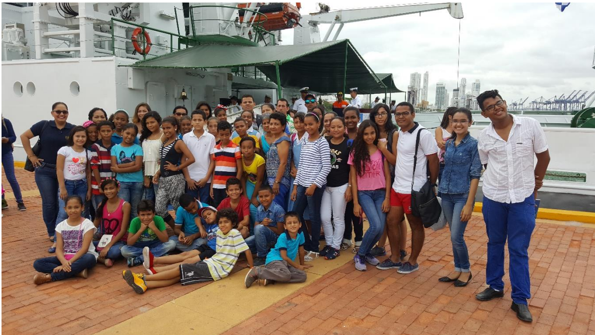
Photo 3. Official photo of young visitors to hydrographic ships