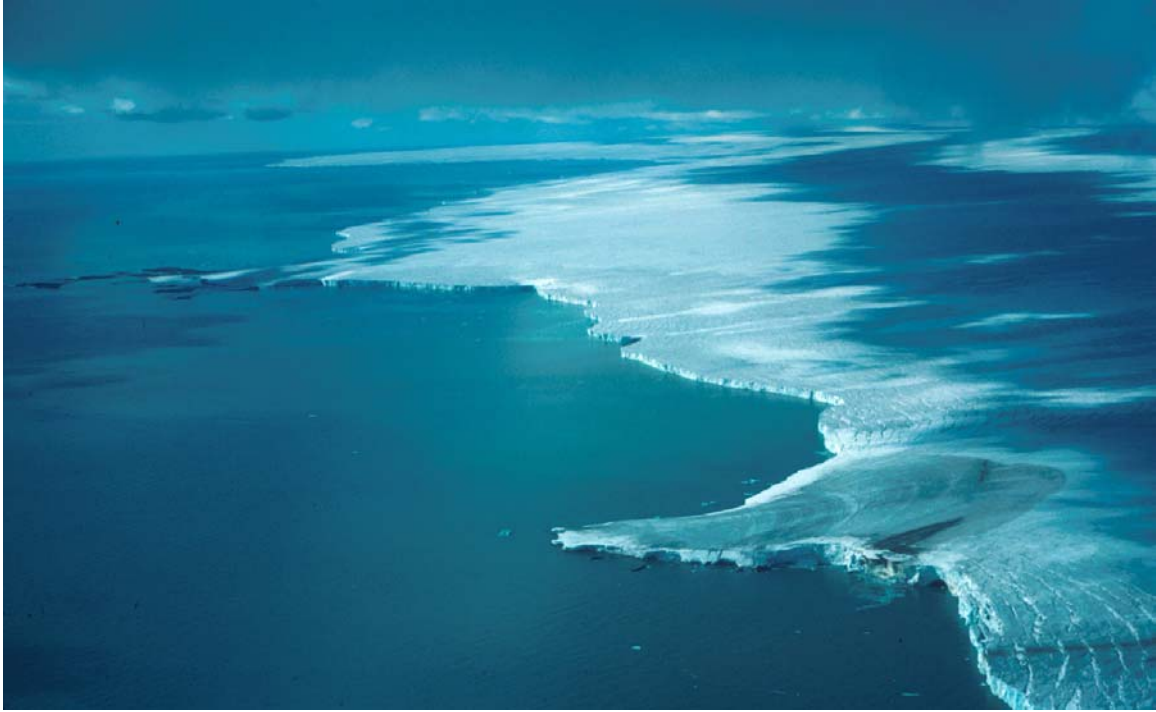
Figure 2. Glacier Austfonna at Svalbard. (Norwegian Polar Institute)