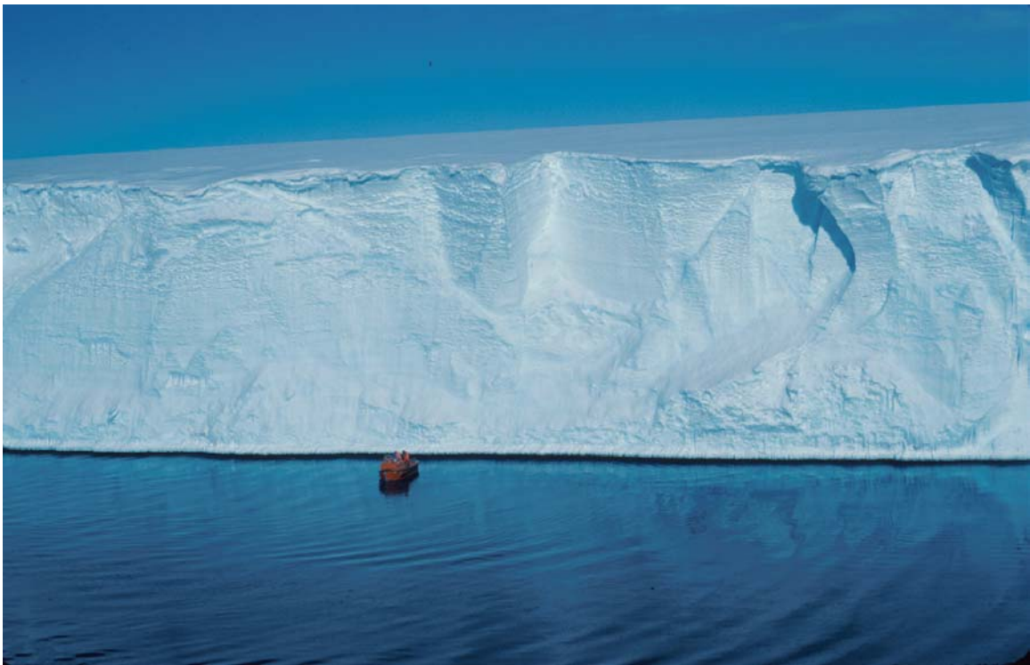
Figure 3. Glacier in Antarctica.