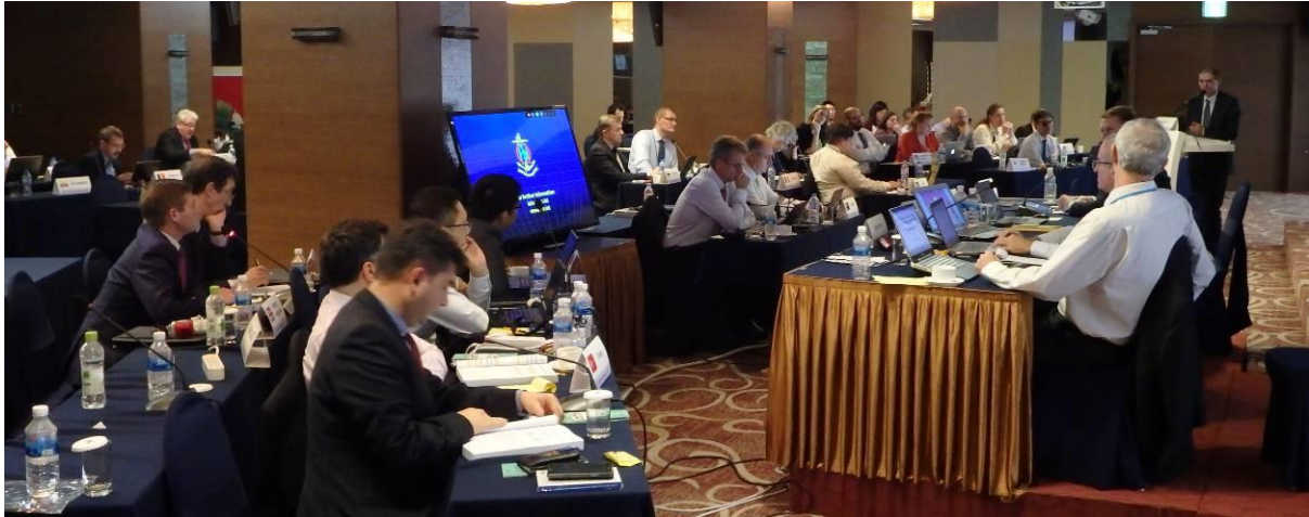
HSSC in session