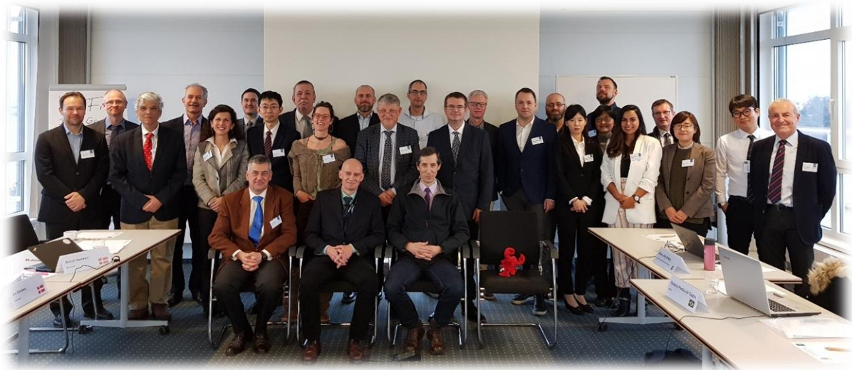
NIPWG-6 participants in Rostock, Germany

The 7 th meeting of the NIPWG is scheduled to be held in Saint-Petersburg, Russian Federation, from 25 to 29 November 2019, and the 8 th meeting, in September 2020 in France.