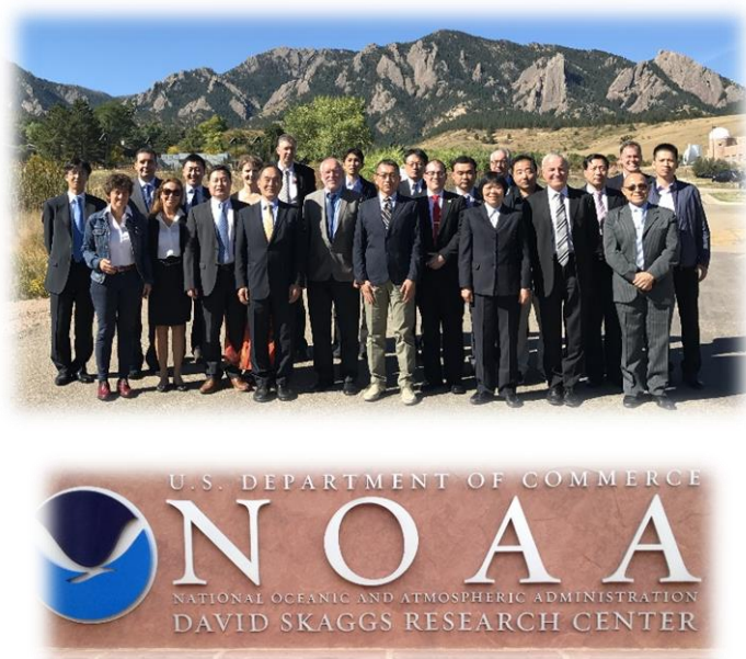
Participants of the SCUFN-29 meeting