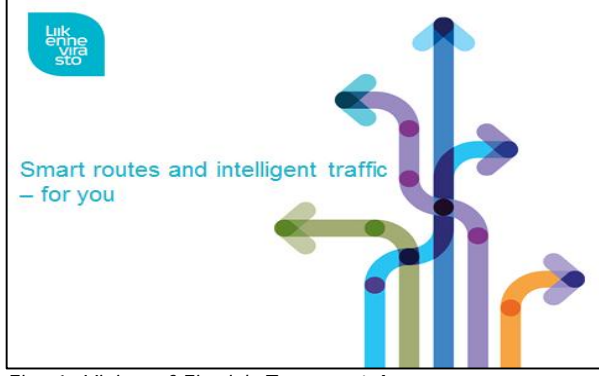
Fig. 1. Vision of Finnish Transport Agency

The FHO has working according to the Quality Management System. A yearly auditing was performed successfully, including also the NtM process.