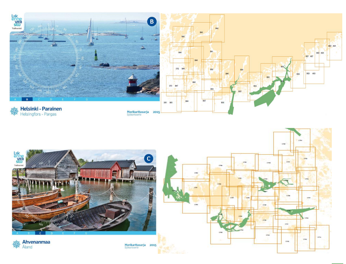
Fig. 2. New editions of nautical chart series for leisure craft spring 2015. New bathymetric data