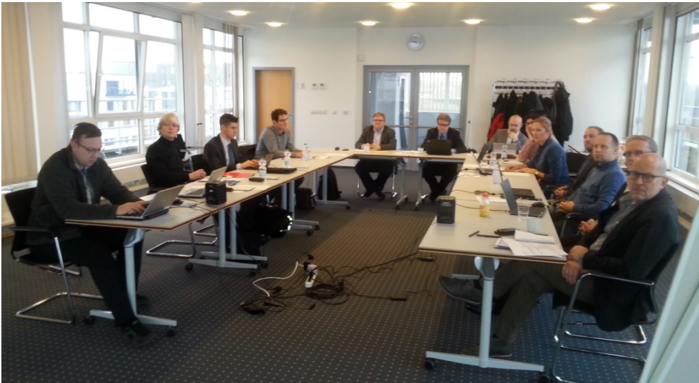
Figure 1. The BS-NSMSDIWG members attending the workshop