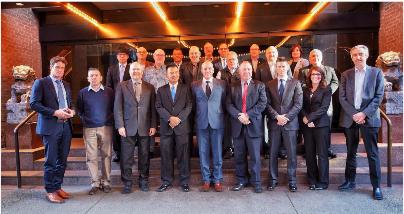
Figure 2. The IHO MSDIWG members attending the meeting.

The aim of the MSDIWG8 meeting was to focus on MSDI and to propose ways to progress MSDI implementation within the Organisation and its Member States.