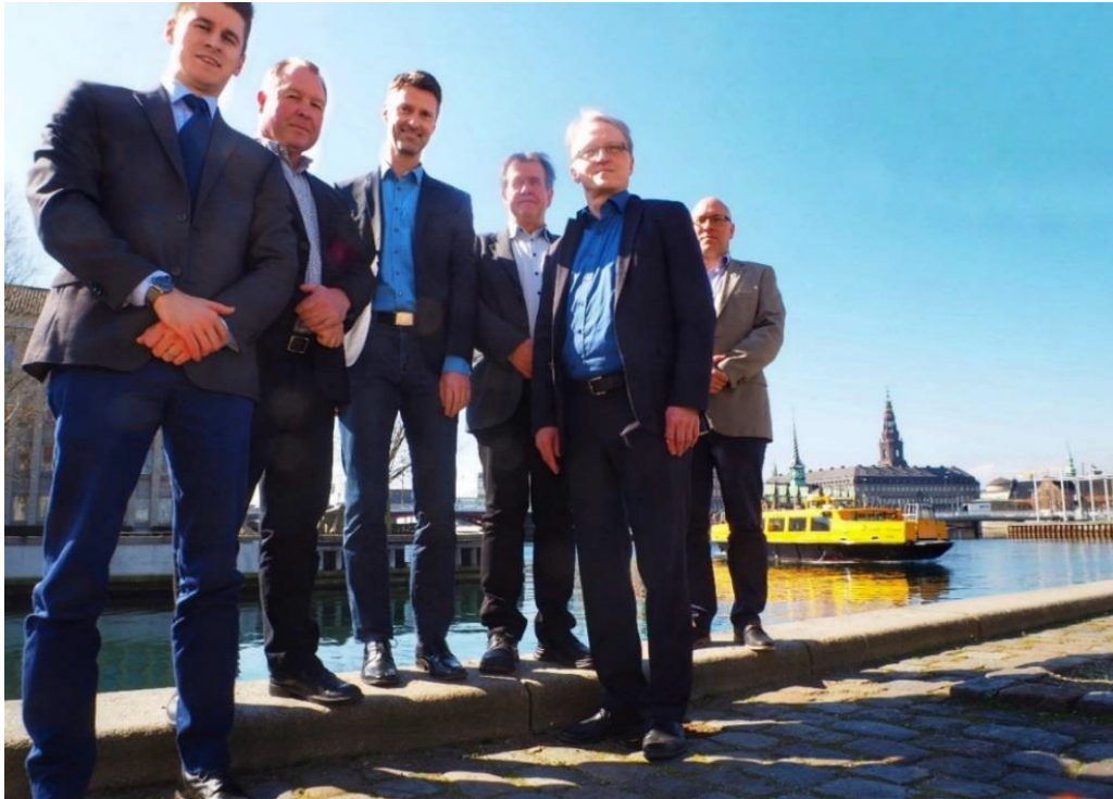
Figure 3 Participants of ARMSDIWG1 - Copenhagen, Denmark