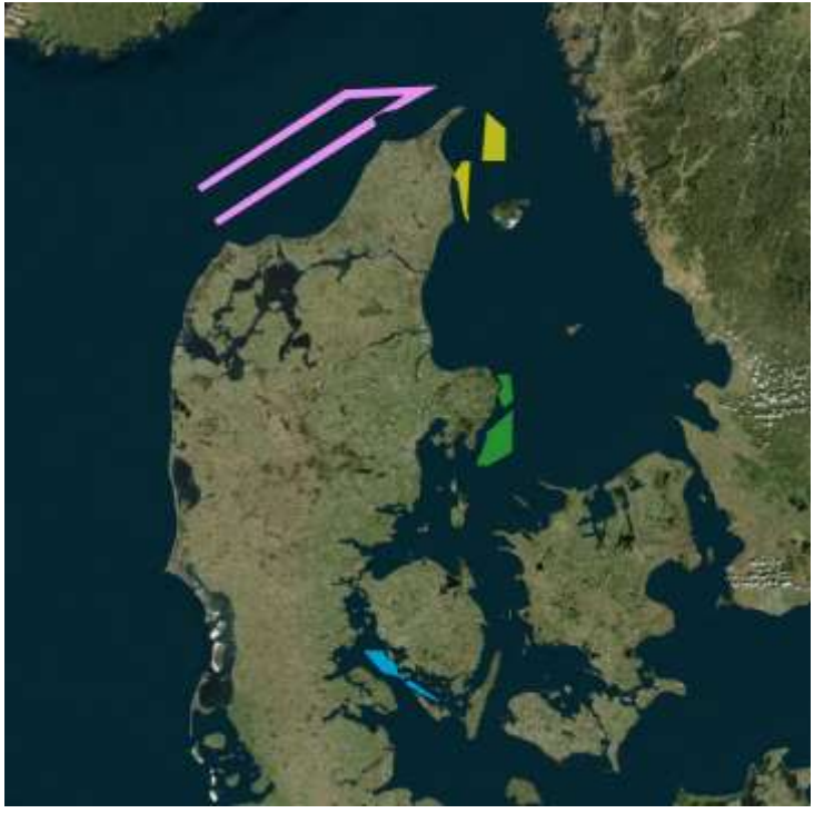
Figure 2. Planned surveys for 2019.

https://helcomresurvey.sjofartsverket.se/helcomresurveysite.