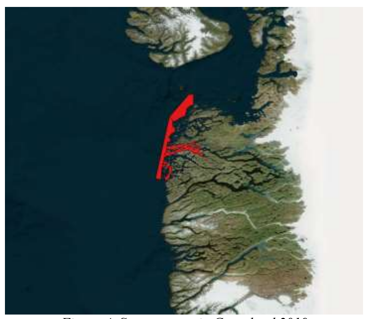
Figure 4. Survey areas in Greenland 2019

The surveys in the Greenland waters in 2019 will be a continuation of the re-surveying program of the inshore routes between ports in Greenland. Some near shore areas and fjords are being surveyed for the safety of cruise ships operating on the west coast.