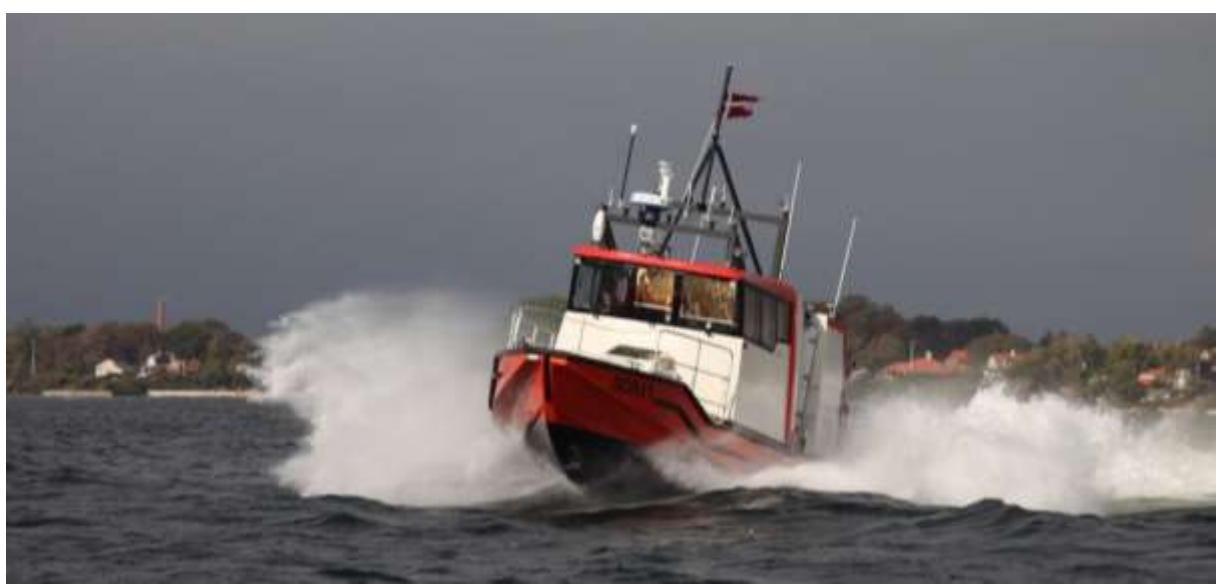
Figure 5. One of two new shallow water survey boats SOM-Class