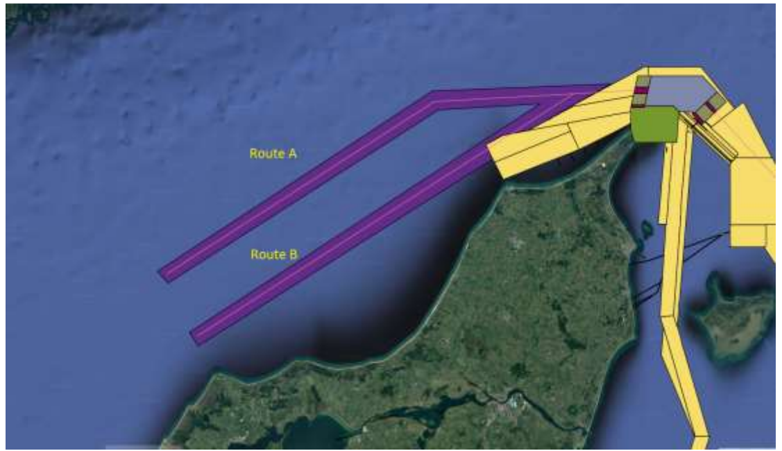
Figure 3. Surveys for 2019.