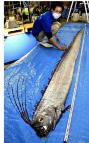
A deep-sea slender oarfish is examined at the Uozu Aquarium in Uozu, Japan.