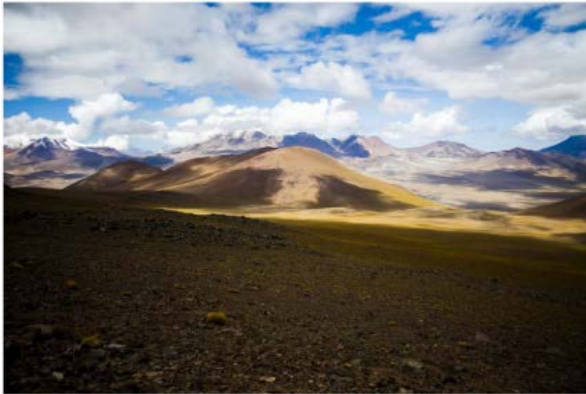
A view of the mountains of the Atacama desert, near the Silala river, at the border between Chile and Bolivia, on Jan 28, 2019.