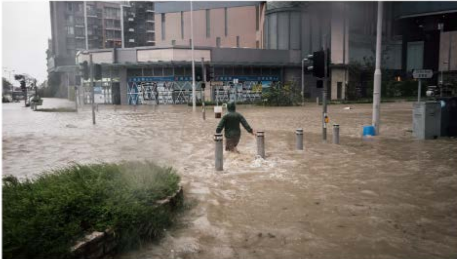
A man wades through flooded streets during a No. 10 Hurricane Signal raised for Typhoon Mangkhut in Hong Kong on Sunday.