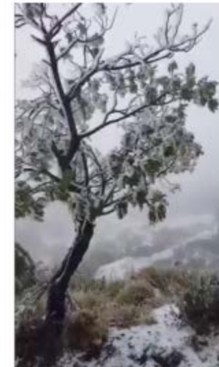
Hawaii saw a mixed bag of bizarre precipitation, with several inches of snow fell on Haleakala, a shield volcano in East Maui in addition to winds of up to 307kmh.