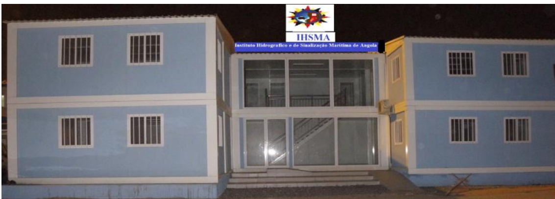
(Technical Facilities Luanda Harbour)

The main responsibility of Instituto Hidrográfico e de Sinalização Marítima de Angola – IHSMA , is to facilitate the safe navigation in the coastal and inland waters through the provision of hydrographic, cartography, oceanography, and maritime signalization services and through the installation, rehabilitation and maintenance of aids to navigation . It has also the function of calibrating magnetic compass.