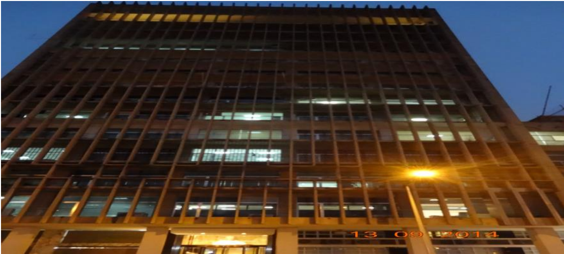
(Head Office Av.4 de Fevereiro nº42-Predio Sécil Marítima-10ºandar)

The Instituto Hidrográfico e de Sinalização Marítima de Angola – IHSMA , is a public institute , under the Ministry of Transports, with legal personality , administrative, financial and patrimonial own , created by Presidential Decree in order to exercise the functions of Coordination , Promotion , Development , Guidance , Control , Inspection, Licensing and Regulation to all activities related to Hydrography , Cartography , Oceanography , Dredging and Maritime Signalization.