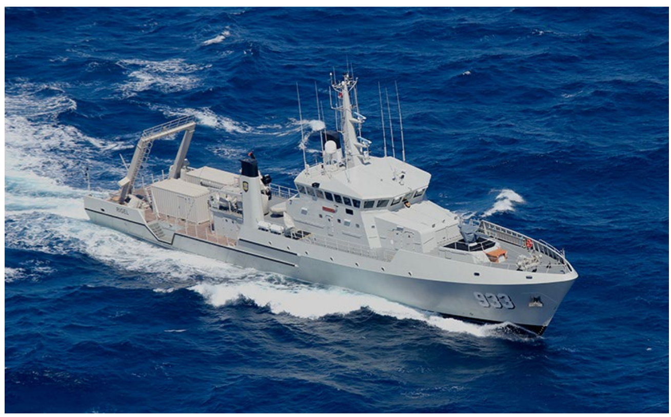
Figure 1. OSV 190 Class Survey Vessel.

9. Acquisition of Survey Vessel . The NN is in the process of acquiring a 60-metre long all-aluminium vessel from the French shipyard Ocea. The OSV 190 class survey vessel is expected to be delivered in late 2019 or early 2020. The arrival of the new vessel would help to enhance the survey capability of Nigeria and ensure that Nigeria maritime space can be surveyed to modern standards.