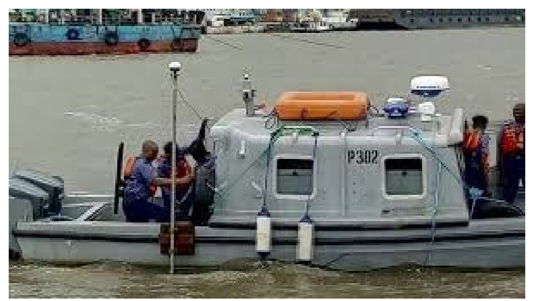
Figure 2. Specially modified EPENAL E-27 Patrol Boat

10. Accreditation of IHO Category 'B' Course at The Nigerian Navy Hydrographic School. The NNHO in September 2012 forwarded a proposal to Eastern Atlantic Hydrographic Commission for IHO assistance in the upgrade and possible accreditation of the Basic Hydrographic Course (BHC) offered at the NNHS. To this end, a team from the IHO Capacity Building Working Group visited the Nigerian Navy Hydrographic School, Port Harcourt from 8-10 march 2018 for an on-the-ground assessment of the school. Currently, efforts are on top gear to meet all the requirements and observations enumerated by the committee in order to ensure the success of the application. It is pertinent to note that the accreditation of the BHC at the NNHS presents a unique opportunity, as it would provides a cheaper, qualitative and easily accessible training for hydrographic surveyors in Nigeria and the West African Sub Region.