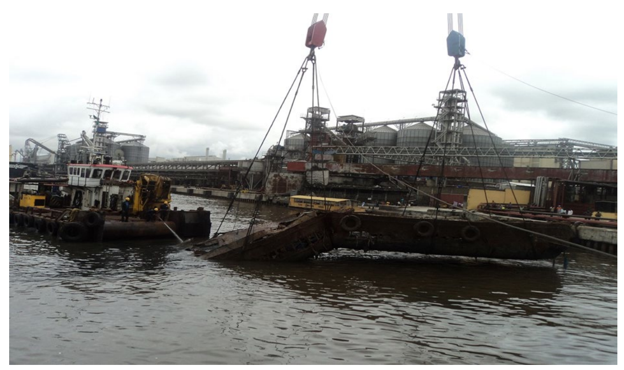
Figure 1. Dredging and wreck removal in Lagos Channel.