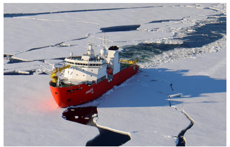
Korean Icebreaker, Araon, sailing on the Southern Ocean.