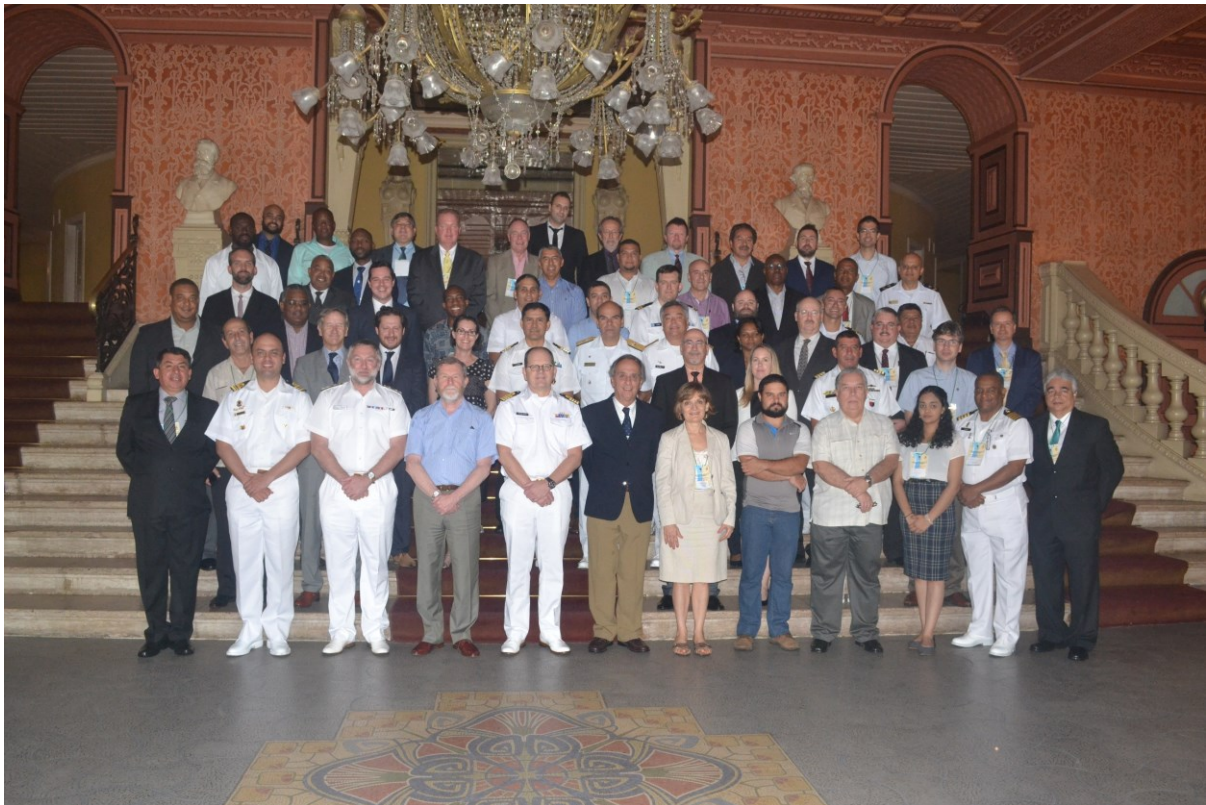
Figure: Participants of MACHC17.