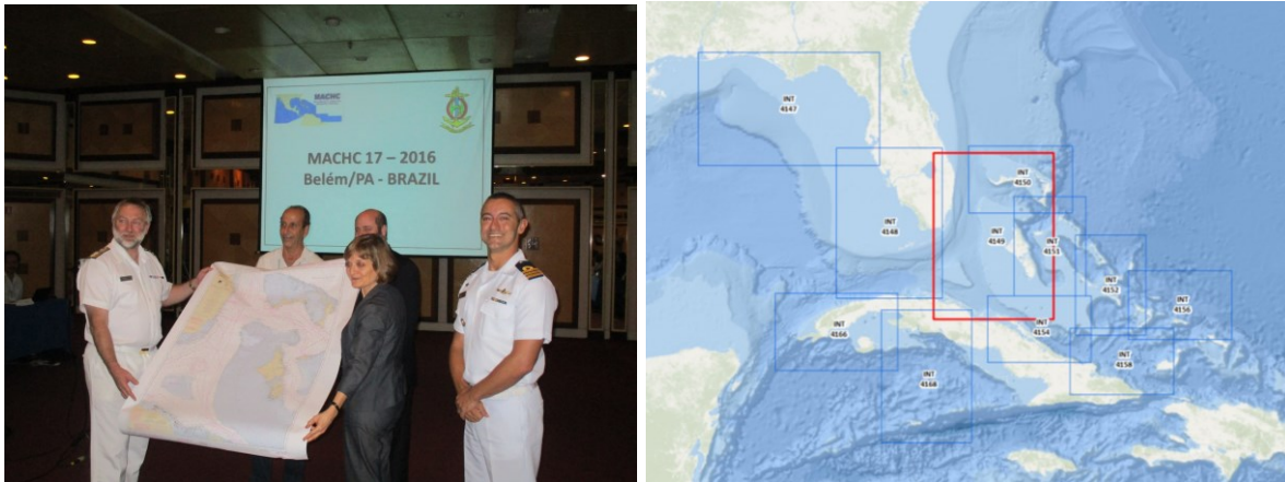
Figures: Presentation of new US/Cuba/UK INT chart 4149.